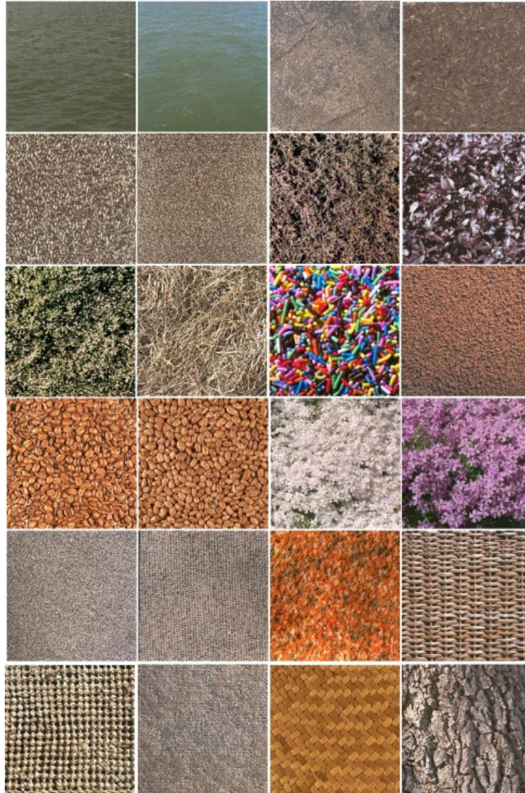
Fig. 2. Images which composed the texture database scaled down for displaying purposes (originally 512x512 pixels).

the same class is made at random among the samples obtained in the computation of features. Classifier built for this purpose has used the k-nearest-neighbours (knn) rule with k=3 . The test samples are used with the classifier and a classification rate is obtained. The whole process is repeated one hundred times and the mean of the error rates of these attempts is taken as the final performance of the classifier.